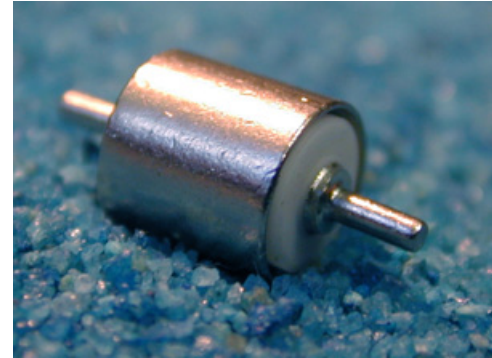
100% Lead-Free (RoHS Compliant)