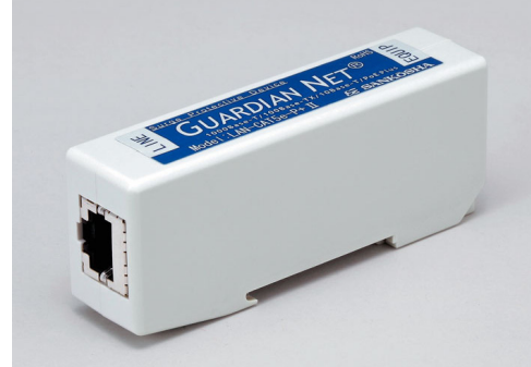
RoHS Compliant and UL 497B Listed (File E140906)