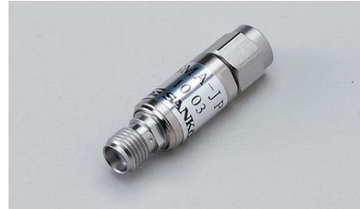
100% Lead-Free (RoHS Compliant)